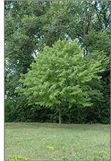
Ruby Frost Red Maple

This tree should only be grown in full sunlight. It is quite adaptable, preferring to grow in average to wet conditions, and will even tolerate some standing water. It may require supplemental watering during periods of drought or extended heat. It is not particular as to soil type, but has a definite preference for acidic soils, and is subject to chlorosis (yellowing) of the foliage in alkaline soils. It is somewhat tolerant of urban pollution. This is a selection of a native North American species.