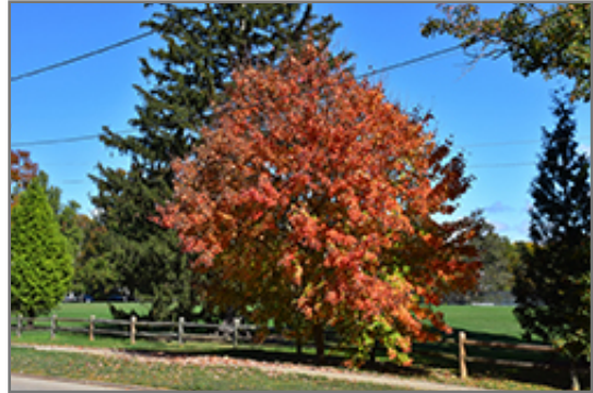
Ruby Frost Red Maple in fall