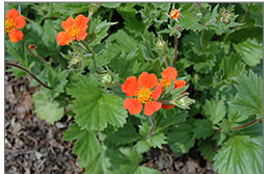
Boris Avens flowers

Boris Avens is recommended for the following landscape applications;