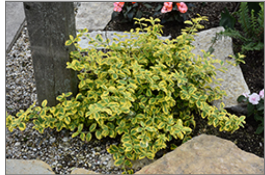
Gold Splash Wintercreeper