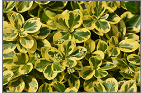
Gold Splash Wintercreeper flower buds

This shrub performs well in both full sun and full shade. It is very adaptable to both dry and moist locations, and should do just fine under typical garden conditions. It may require supplemental watering during periods of drought or extended heat. It is not particular as to soil type or pH. It is highly tolerant of urban pollution and will even thrive in inner city environments, and will benefit from being planted in a relatively sheltered location. This is a selected variety of a species not originally from North America.