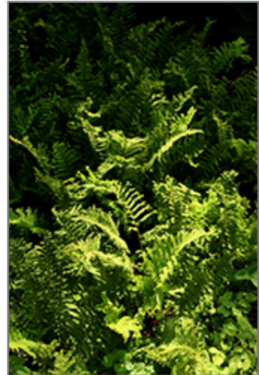
Lady Fern foliage