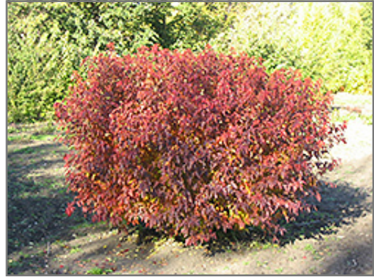
Atomic Amur Maple in fall

This shrub does best in full sun to partial shade. It is very adaptable to both dry and moist locations, and should do just fine under average home landscape conditions. It may require supplemental watering during periods of drought or extended heat. It is not particular as to soil type or pH. It is highly tolerant of urban pollution and will even thrive in inner city environments. This is a selected variety of a species not originally from North America.