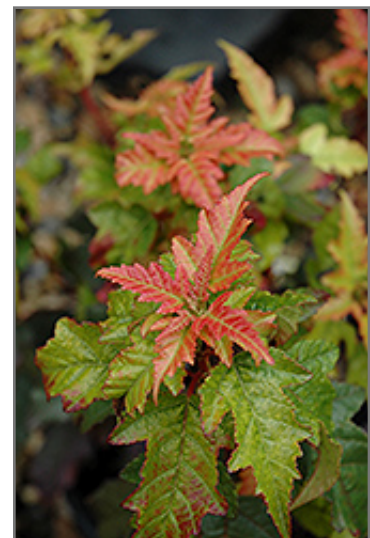
Atomic Amur Maple in fall