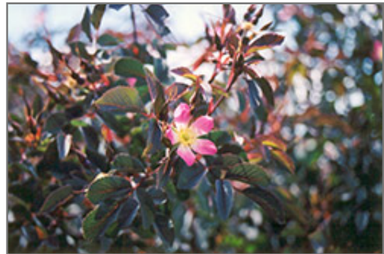
Red Leaf Rose flowers