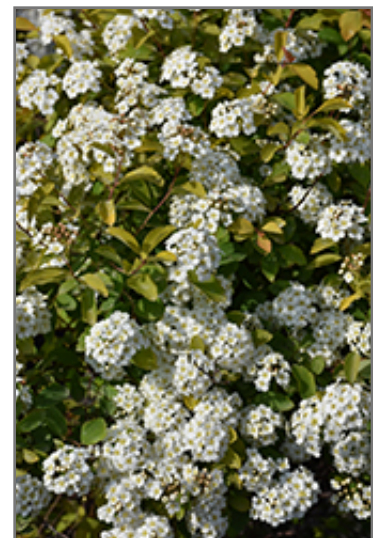
Firegold Spirea flowers