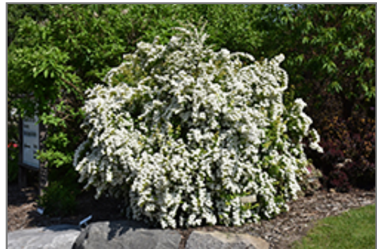
Firegold Spirea in bloom

Firegold Spirea is recommended for the following landscape applications;