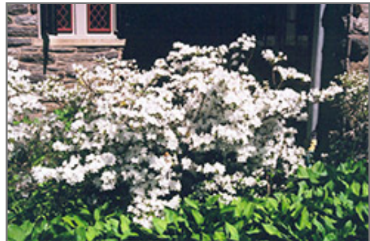
Laughing Waters Azalea in bloom

Laughing Waters Azalea will grow to be about 8 feet tall at maturity, with a spread of 8 feet. It tends to be a little leggy, with a typical clearance of 1 foot from the ground, and is suitable for planting under power lines. It grows at a slow rate, and under ideal conditions can be expected to live for 40 years or more.