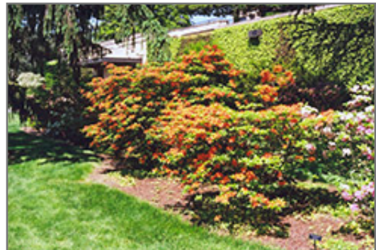
Coccinea Speciosa Azalea in bloom