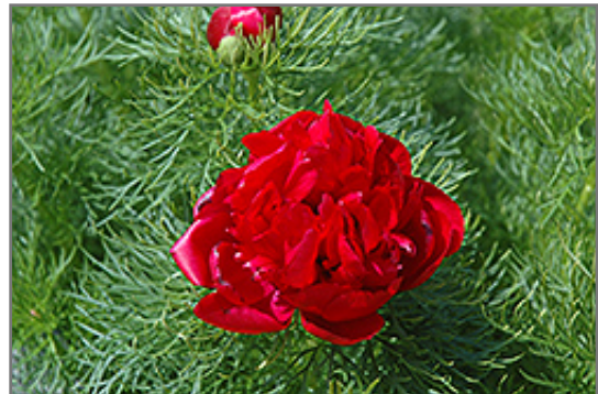
Double Fernleaf Peony flowers