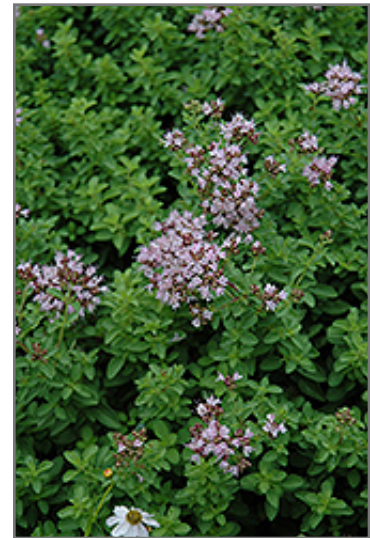
Dwarf Oregano flowers

Aside from its primary use as an edible, Dwarf Oregano is suitable for the following landscape applications;