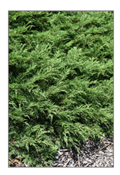
Northern Pride Russian Cypress