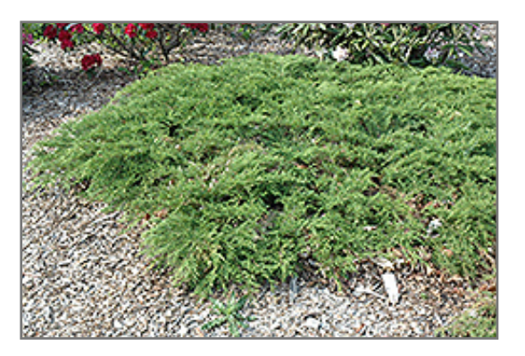
Northern Pride Russian Cypress