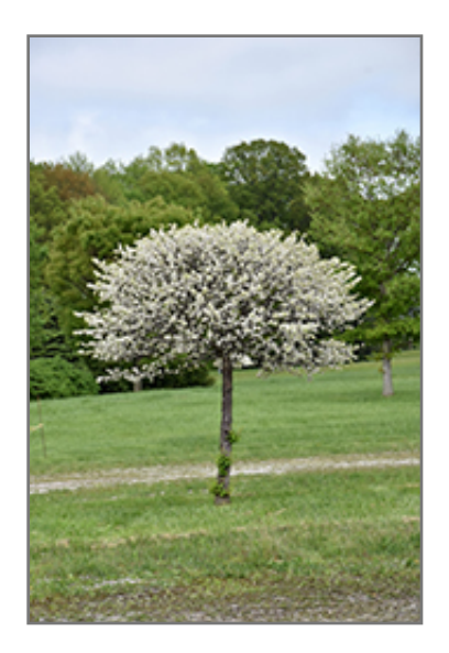
Lollipop Flowering Crab in bloom

This shrub should only be grown in full sunlight. It prefers to grow in average to moist conditions, and shouldn't be allowed to dry out. It may require supplemental watering during periods of drought or extended heat. It is not particular as to soil type or pH. It is highly tolerant of urban pollution and will even thrive in inner city environments. This particular variety is an interspecific hybrid.