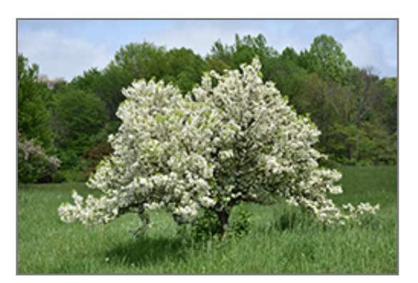
Lollipop Flowering Crab in bloom

This is a high maintenance shrub that will require regular care and upkeep, and is best pruned in late winter once the threat of extreme cold has passed. Gardeners should be aware of the following characteristic(s) that may warrant special consideration;