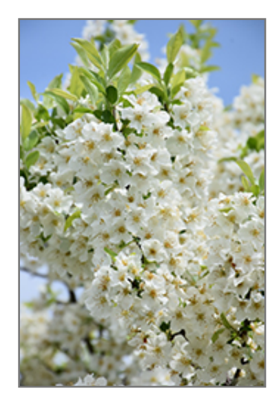
Lollipop Flowering Crab flowers