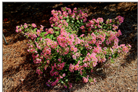
Bellini Guava Crapemyrtle in bloom