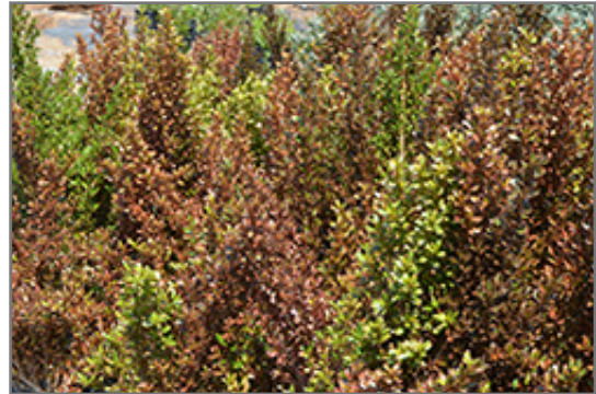
Evening Glow Mirror Bush