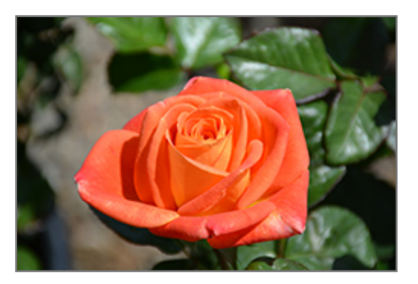
Burst Of Joy Rose flowers