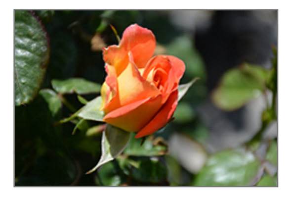
Burst Of Joy Rose flower buds