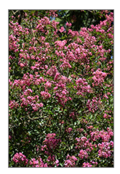
Pecos Crapemyrtle flowers

8546 Sun Valley Road Anytown, USA 12345 204.782.4147