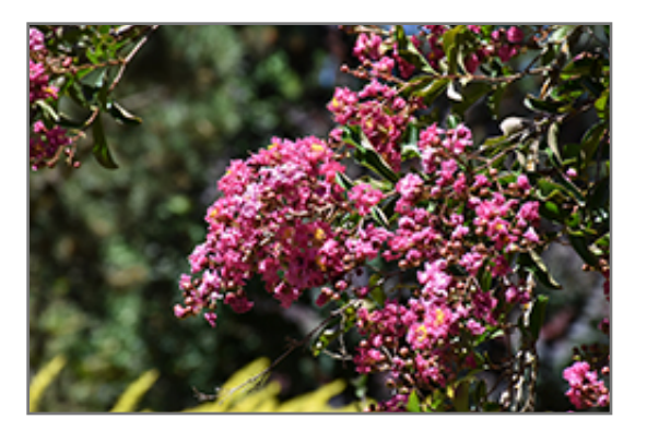
Pecos Crapemyrtle flowers

Pecos Crapemyrtle will grow to be about 12 feet tall at maturity, with a spread of 10 feet. It has a low canopy with a typical clearance of 1 foot from the ground, and is suitable for planting under power lines. It grows at a medium rate, and under ideal conditions can be expected to live for approximately 20 years.