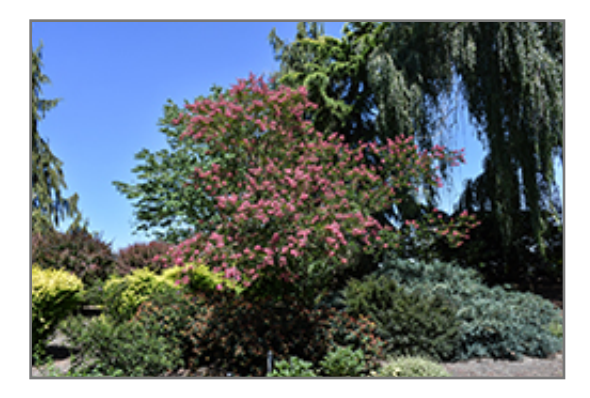
Pecos Crapemyrtle in bloom

Pecos Crapemyrtle is recommended for the following landscape applications;