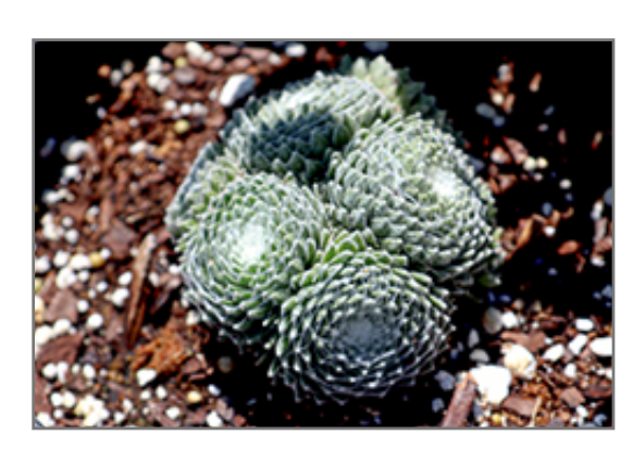
Colorockz Arctic White Hens And Chicks

This is a dense herbaceous houseplant with tall flower stalks held atop a low mound of foliage. Its relatively fine texture sets it apart from other indoor plants with less refined foliage. This plant should not require much pruning, except when necessary to keep it looking its best.