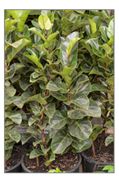
Little Sunshine Dwarf Fiddle Leaf Fig in full

When grown indoors, Little Sunshine Dwarf Fiddle Leaf Fig can be expected to grow to be about 5 feet tall at maturity, with a spread of 30 inches. It grows at a medium rate, and under ideal conditions can be expected to live for approximately 100 years. This houseplant will do well in a location that gets either direct or indirect sunlight, although it will usually require a more brightly-lit environment than what artificial indoor lighting alone can provide. It does best in average to evenly moist soil, but will not tolerate standing water. The surface of the soil shouldn't be allowed to dry out completely, and so you should expect to water this plant once and possibly even twice each week. Be aware that your particular watering schedule may vary depending on its location in the room, the pot size, plant size and other conditions; if in doubt, ask one of our experts in the store for advice. It will benefit from a regular feeding with a general-purpose fertilizer with every second or third watering. It is not particular as to soil type, but has a definite preference for acidic soil. Contact the store for specific recommendations on pre-mixed potting soil for this plant. Be warned that parts of this plant are known to be toxic to humans and animals, so special care should be exercised if growing it around children and pets.