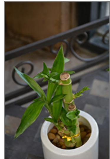
Lucky Bamboo foliage