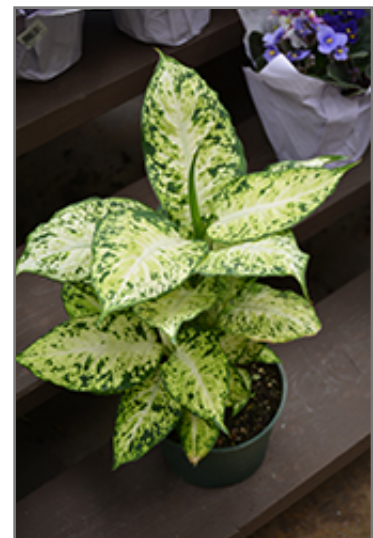
Amy Dieffenbachia in full