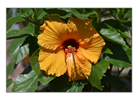
Jazzy Jewel Amber Hibiscus flowers

This tropical plant does best in full sun to partial shade. It requires an evenly moist well-drained soil for optimal growth, but will die in standing water. It may require supplemental watering during periods of drought or extended heat. To help this plant achive its best flowering performance, periodically apply a flower-boosting fertilizer from early spring through into the active growing season. It is not particular as to soil pH, but grows best in rich soils. It is highly tolerant of urban pollution and will even thrive in inner city environments. Consider applying a thick mulch around the root zone in winter to protect it in exposed locations or colder microclimates. This is a selected variety of a species not originally from North America. It can be propagated by cuttings; however, as a cultivated variety, be aware that it may be subject to certain restrictions or prohibitions on propagation.