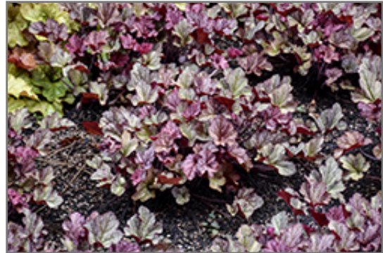
Coralberry Coral Bells