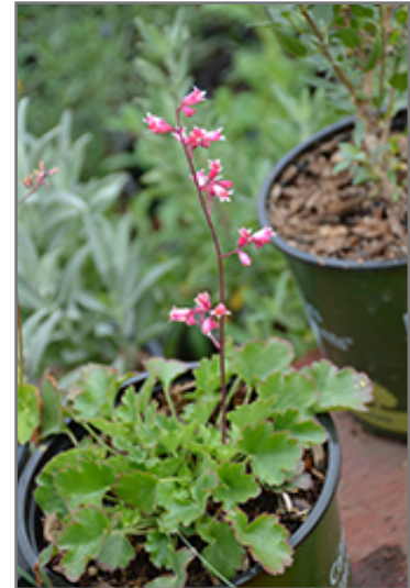
Jack O' the Rocks in bloom