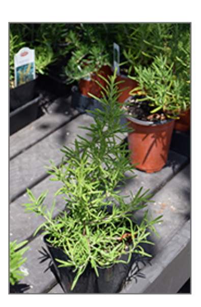
Golden Rain Rosemary

Aside from its primary use as an edible, Golden Rain Rosemary is sutiable for the following landscape applications;