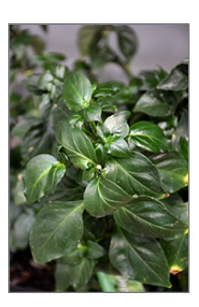
Mushroom Plant foliage