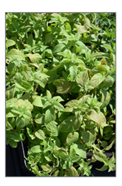
Banana Mint

Aside from its primary use as an edible, Banana Mint is sutiable for the following landscape applications;