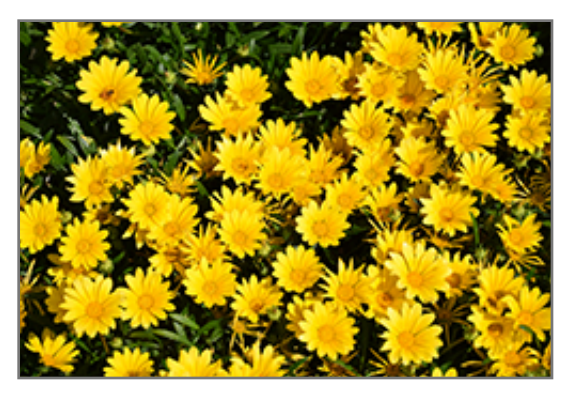
One-flowered Treasure Flower flowers

8546 Sun Valley Road Anytown, USA 12345 204.782.4147