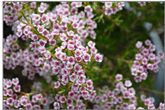
Southern Stars Waxflower flowers