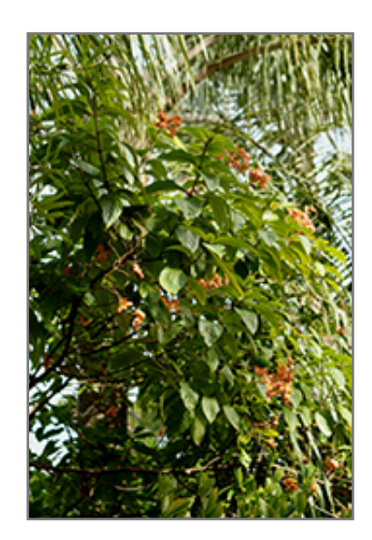
Marmalade Mussaenda flowers