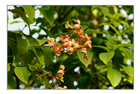
Marmalade Mussaenda flowers

This plant is native to the tropics and prefers growing in moist environments with evenly warm conditions all year round. In our climate, it is usually grown as an outdoor annual in the garden or in a container. If you want it to survive the winter, it can be brought in to the house and provided with special care, and then returned to the garden the following season. In its preferred tropical habitat, as a shrub it can grow to be around 10 feet tall at maturity, with a spread of 12 feet. However, when grown as an annual or when overwintered indoors, it can be expected to perform quite differently, and its exact height and spread will depend on many factors; you may wish to consult with our experts as to how it might perform in your specific application and growing conditions.