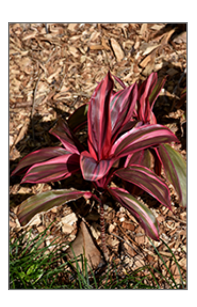
Electra Hawaiian Ti Plant

When grown indoors, Electra Hawaiian Ti Plant can be expected to grow to be about 24 inches tall at maturity, with a spread of 24 inches. It grows at a medium rate, and under ideal conditions can be expected to live for approximately 10 years. This houseplant will do well in a location that gets either direct or indirect sunlight, although it will usually require a more brightly-lit environment than what artificial indoor lighting alone can provide. It does best in average to evenly moist soil, but will not tolerate standing water. The surface of the soil shouldn't be allowed to dry out completely, and so you should expect to water this plant once and possibly even twice each week. Be aware that your particular watering schedule may vary depending on its location in the room, the pot size, plant size and other conditions; if in doubt, ask one of our experts in the store for advice. It will benefit from a regular feeding with a general-purpose fertilizer with every second or third watering. It is not particular as to soil type or pH; an average potting soil should work just fine.