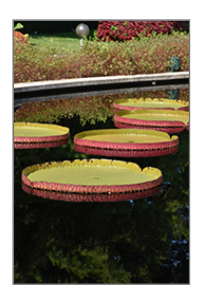
Santa Cruz Tropical Water Lily

This plant will require occasional maintenance and upkeep, and should be cut back in late fall in preparation for winter. It has no significant negative characteristics.