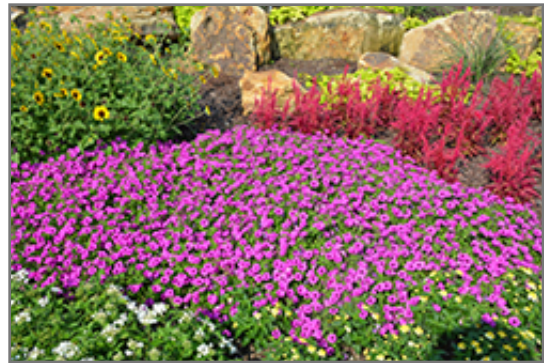
Supertunia Mini Vista Sweet Sangria Petunia in bloom

Supertunia Mini Vista Sweet Sangria Petunia is a fine choice for the garden, but it is also a good selection for planting in outdoor containers and hanging baskets. Because of its trailing habit of growth, it is ideally suited for use as a 'spiller' in the 'spiller-thriller-filler' container combination; plant it near the edges where it can spill gracefully over the pot. Note that when growing plants in outdoor containers and baskets, they may require more frequent waterings than they would in the yard or garden.