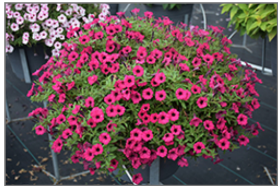
Supertunia Mini Vista Sweet Sangria Petunia in bloom