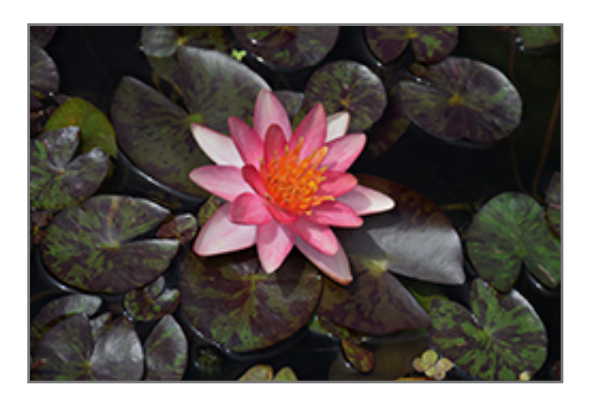
Indiana Hardy Water Lily flowers