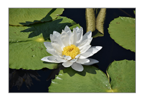
Hudsonii Hardy Water Lily flowers