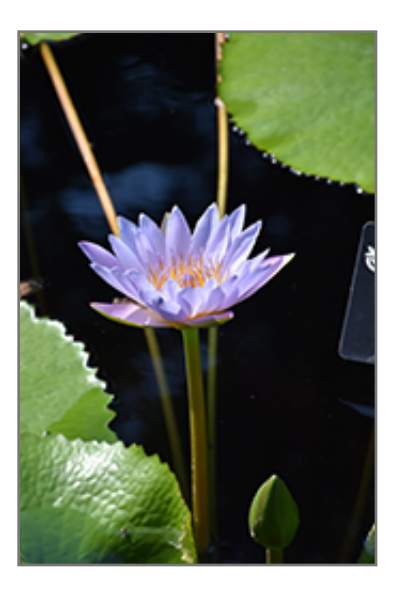
August Koch Tropical Water Lily flowers