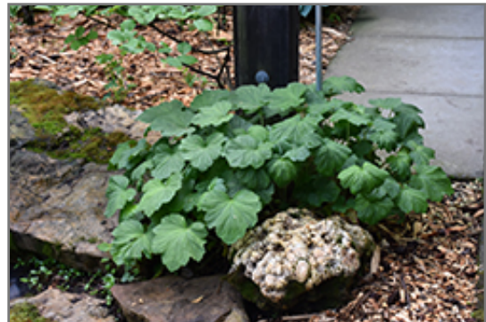
Coral Bells