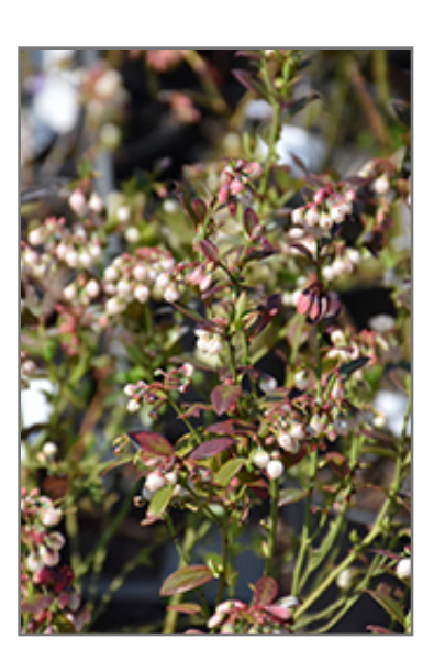
Buckle Blueberry flowers

This is a multi-stemmed evergreen shrub with a mounded form. Its average texture blends into the landscape, but can be balanced by one or two finer or coarser trees or shrubs for an effective composition. This is a relatively low maintenance plant, and usually looks its best without pruning, although it will tolerate pruning. It is a good choice for attracting birds to your yard. It has no significant negative characteristics.