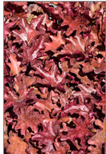
Peach Flambe Coral Bells foliage

This is a relatively low maintenance plant, and should be cut back in late fall in preparation for winter. It is a good choice for attracting hummingbirds to your yard. It has no significant negative characteristics.