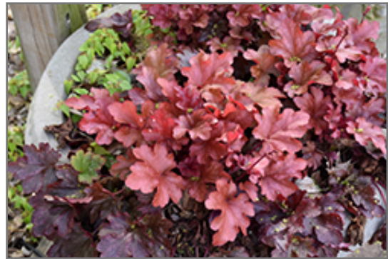
Peach Flambe Coral Bells

Peach Flambe Coral Bells is a fine choice for the garden, but it is also a good selection for planting in outdoor pots and containers. It is often used as a 'filler' in the 'spiller-thriller-filler' container combination, providing a mass of flowers and foliage against which the larger thriller plants stand out. Note that when growing plants in outdoor containers and baskets, they may require more frequent waterings than they would in the yard or garden.