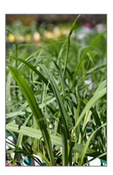
Lemon Grass foliage