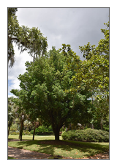
Asian Barberry