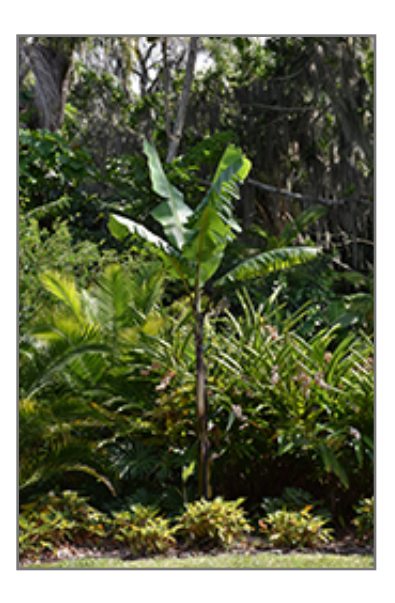
Thai Black Banana

Thai Black Banana is recommended for the following landscape applications;