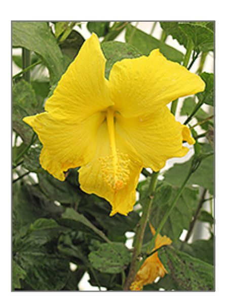
Butterfly Hibiscus flowers

When grown indoors, Butterfly Hibiscus can be expected to grow to be about 4 feet tall at maturity, with a spread of 3 feet. It grows at a fast rate, and under ideal conditions can be expected to live for approximately 5 years. This houseplant will do well in a location that gets either direct or indirect sunlight, although it will usually require a more brightly-lit environment than what artificial indoor lighting alone can provide. It requires an evenly moist well-drained soil for optimal growth, but will suffer if left to grow in standing water. The surface of the soil shouldn't be allowed to dry out completely, and so you should expect to water this plant once and possibly even twice each week. Be aware that your particular watering schedule may vary depending on its location in the room, the pot size, plant size and other conditions; if in doubt, ask one of our experts in the store for advice. It will benefit from a regular feeding with a general-purpose fertilizer with every second or third watering. It is not particular as to soil pH, but grows best in rich soil. Contact the store for specific recommendations on pre-mixed potting soil for this plant.