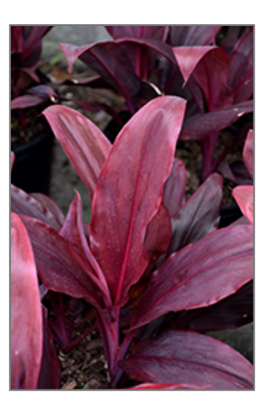
Auntie Lou Hawaiian Ti Plant foliage

When grown indoors, Auntie Lou Hawaiian Ti Plant can be expected to grow to be about 5 feet tall at maturity, with a spread of 3 feet. It grows at a medium rate, and under ideal conditions can be expected to live for approximately 10 years. This houseplant will do well in a location that gets either direct or indirect sunlight, although it will usually require a more brightly-lit environment than what artificial indoor lighting alone can provide. It does best in average to evenly moist soil, but will not tolerate standing water. The surface of the soil shouldn't be allowed to dry out completely, and so you should expect to water this plant once and possibly even twice each week. Be aware that your particular watering schedule may vary depending on its location in the room, the pot size, plant size and other conditions; if in doubt, ask one of our experts in the store for advice. It will benefit from a regular feeding with a general-purpose fertilizer with every second or third watering. It is not particular as to soil type or pH; an average potting soil should work just fine.