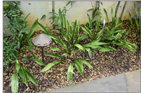
Nagoya Stars Cast Iron Plant