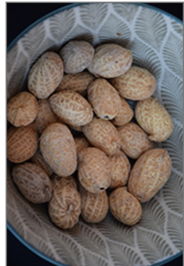
Peanut fruit

This is an herbaceous evergreen perennial with a mounded form. Its relatively fine texture sets it apart from other garden plants with less refined foliage. This is a relatively low maintenance plant, and should be cut back in late fall in preparation for winter. It is a good choice for attracting bees and butterflies to your yard. It has no significant negative characteristics.