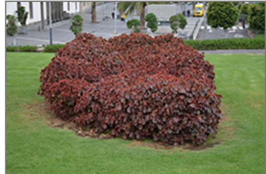
Obovata Copperleaf