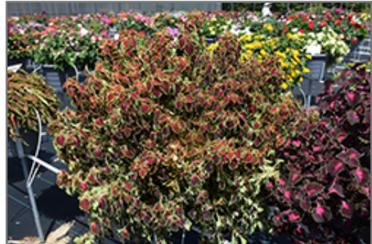
TrailBlazer Glory Road Coleus