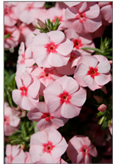
Gisele Light Pink+Eye Phlox flowers

Gisele Light Pink+Eye Phlox is recommended for the following landscape applications;