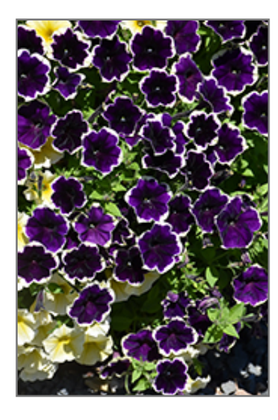
SureShot Blueberries & Cream Petunia flowers

This plant will require occasional maintenance and upkeep. Trim off the flower heads after they fade and die to encourage more blooms late into the season. It is a good choice for attracting bees and butterflies to your yard, but is not particularly attractive to deer who tend to leave it alone in favor of tastier treats. It has no significant negative characteristics.